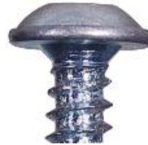
Pan with Washer