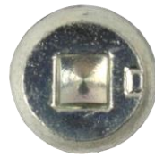
#2 Square Drive